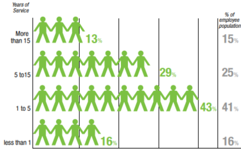
Fig. 1. Correlation between years of service and usage of OOO

...everyone, from newly hired employees to those who have been here for years